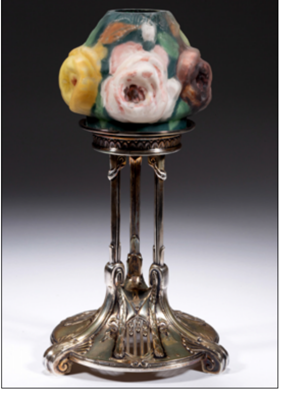
Pairpoint Puffy floral shade pedestal candle/fairy lamp, circa 1920, 10½ inches high, $4,972.

and far. Levels of online participation in our auctions continue to expand dramatically for us — a real indication that there is increased market demand for a diverse range of art and antiques. The overall excitement and strong sales results reflect the freshness and high quality of the merchandise offered. Additionally. only two lots in the entire three-day sale carried a reserve, and both of them sold successfully. Given the unique conditions created by the COVID-19 virus, we had to make several adjustments to our sale procedures, and we also offered a number of incentives for buyers to bid remotely. This strategy definitely paid off." Evans added, "Looking forward, we have a number of fine collections in house that we will be featuring in the coming months, so we are excited about the future at JSEA." The firm's next Fine & Decorative Arts Auction will be held in October. All prices quote include buyer's premium as reported by the auction house. For additional information, www.jeffreysevans.com or 540-434-3939.