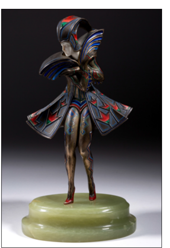
Gerda Gerdago Art Deco enameled bronze figure of a dancer, $7,020.